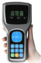
Wireless PII indicator