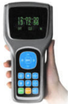
Wireless PII indicator