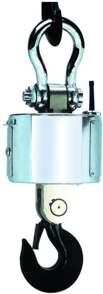
Wireless Crane Scale