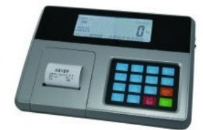
C II Indicator

Distributor (US and Canada) Optoco Inc. 600 - 2498 West 41st Ave Vancouver, BC, V6M 2A7 Tel: 778-706-6933 Email: info@optoco.ca Web: www.crane-scale.com